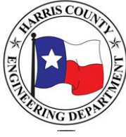
EXHIBIT C: ENGINEER TEAM ACKNOWLEDGMENTS