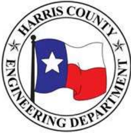
EXHIBIT A: SCOPE OF CONSTRUCTION PHASE SERVICES