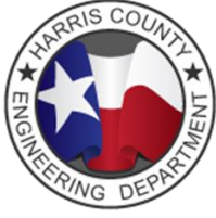
EXHIBIT C: ENGINEER TEAM ACKNOWLEDGMENTS