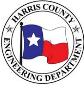
EXHIBIT A: SCOPE OF CONSTRUCTION PHASE SERVICES