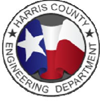
EXHIBIT C: ENGINEER TEAM ACKNOWLEDGMENTS