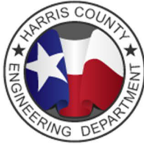
EXHIBIT D: ENGINEER TEAM ACKNOWLEDGMENTS