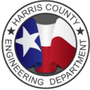
EXHIBIT A: SCOPE OF CONSTRUCTION PHASE SERVICES