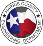
EXHIBIT D: ENGINEER TEAM ACKNOWLEDGMENTS