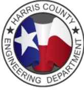
EXHIBIT D: ENGINEER TEAM ACKNOWLEDGMENTS