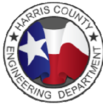
EXHIBIT D: ENGINEER TEAM ACKNOWLEDGMENTS