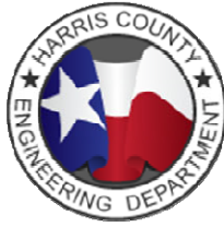
EXHIBIT D: ENGINEER TEAM ACKNOWLEDGMENTS