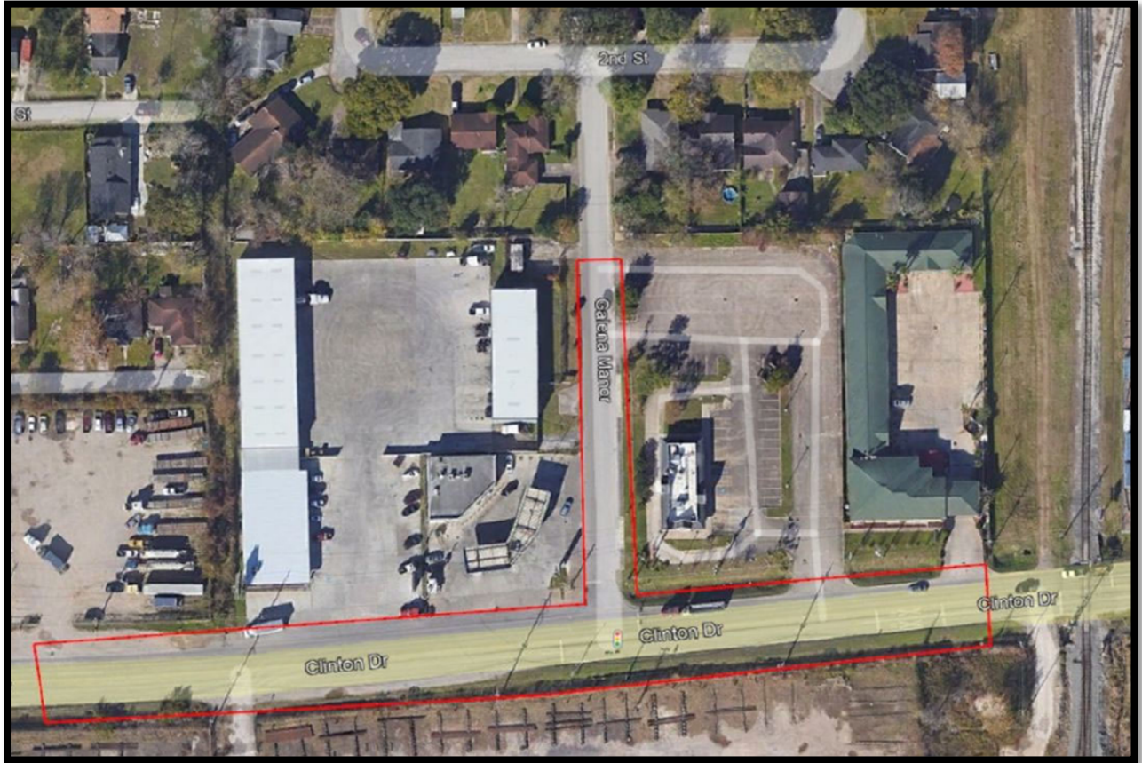
Figure "A" Project Limits