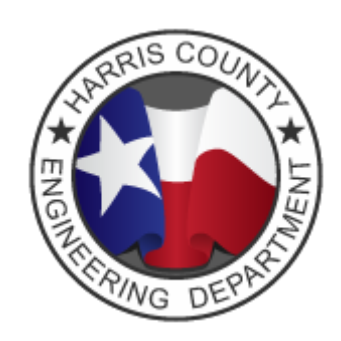
EXHIBIT A: SCOPE OF CONSTRUCTION PHASE SERVICES