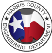
EXHIBIT D: ENGINEER TEAM ACKNOWLEDGMENTS