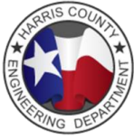
EXHIBIT D: ENGINEER TEAM ACKNOWLEDGMENTS